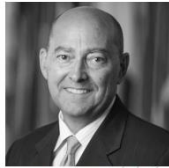
Admiral James Stavridis U.S. Navy (Retired) Partner and Vice Chairman Global Affairs, Carlyle Group