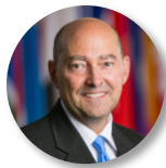
Admiral James Stavridis

From cybersecurity to shifting alliances, the external environment is increasingly volatile. Admiral James Stavridis, former NATO Supreme Allied Commander and Commander of U.S. Southern Command, offers a strategic briefing on the geopolitical forces shaping the business climate. Now Vice Chair at The Carlyle Group, he shares exactly what CHROs should be watching—and why steady leadership is the ultimate risk mitigation tool. Attendees will receive a signed copy of his book, The Admiral's Bookshelf .